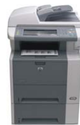
HP LaserJet M3035xs MFP (CB415A)

All the features of the base model, plus: