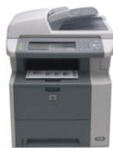
HP LaserJet M3035 MFP (CB414A)