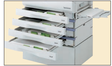
AR-M207E shown with optional paper trays, for a total online paper capacity of 1,100 sheets.

Add powerful fax functionality to the AR-M162E/M207E with the Super G3 fax module. With 350 Auto-Dial numbers and Broadcasting Capability up to 200 destinations, the AR-M162E/M207E IMAGERS can easily handle high-volume faxing environments.